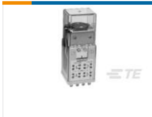
TE Part #1-1423155-4 GPF=RELAY, 250VDC