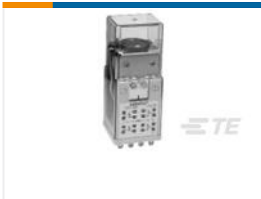
TE Part #1-1423155-5 GPFN=RLY,GEN,PURP, 250VDC