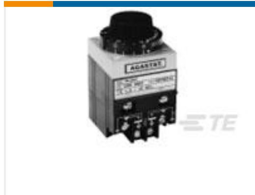
TE Part #4-1423159-1 7012PKLLX=RLY,STD,ON, 2P,125VDC