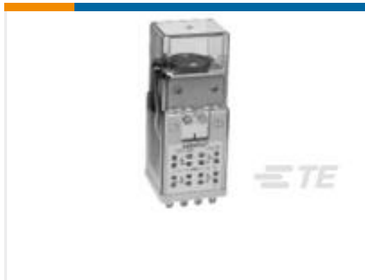
TE Part #1423155-3 GPC=RELAY,48VDC