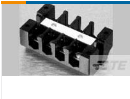
TE Part #4-1437382-0 B106-BU=1 PIECE TERMINAL BLOCK