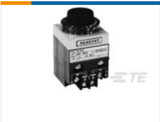
TE Part #8-1472969-6 7022PBX=RLY,STD,OFF,2P, 125V,5S,X OPT