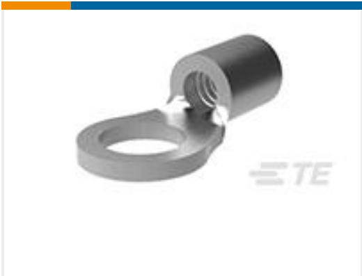
TE Part #2-321684-1 TERMINAL,SOLIS R 16-14 6