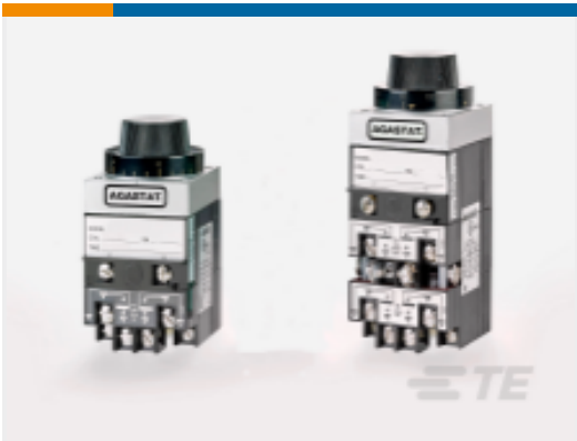
TE Part # 2-1423159-3 7012PC=RLY,STD,ON,2P, 125VDC,15