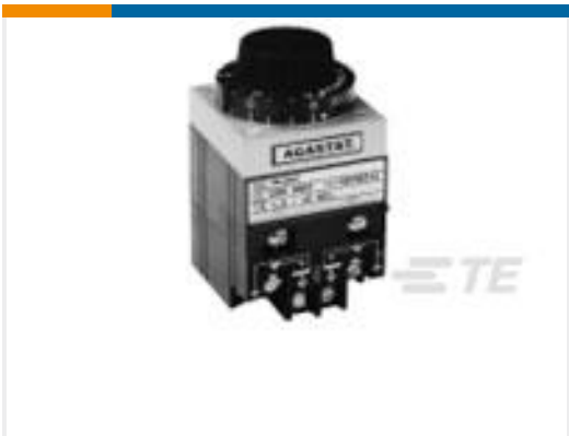
TE Part #5-1423159-5 7012SJX=RLY,STD,ON,2P, 250VDC,